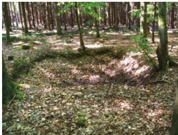
Bomb and shell craters, left over from the fighting in 1944, can still be found among the trees of the Hürtgen Forest.

realized he did not have sufficient strength to hold them both should the enemy inevitably counterattack.