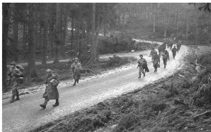
Men of the 13th Infantry Regiment, 8th Infantry Division advance along a muddy road through the dense forest. The 8th was brought in to relieve the hard-hit 4th Infantry Division, but it also was decimated by the tenacious German defense.

The Americans poured more than 15,000 artillery shells into enemy lines, and in a brief break in the weather fighters of the 366th Fighter Group bombed and strafed suspected enemy positions. But CCR's effort was over. It had lost 150 men in the morning hours of November 25 and had not advanced at all; CCR withdrew to await more favorable circumstances. For the tired infantrymen of the 121st Infantry Regiment, it meant more days in the forbidding forest trying to clear out the stubborn enemy.