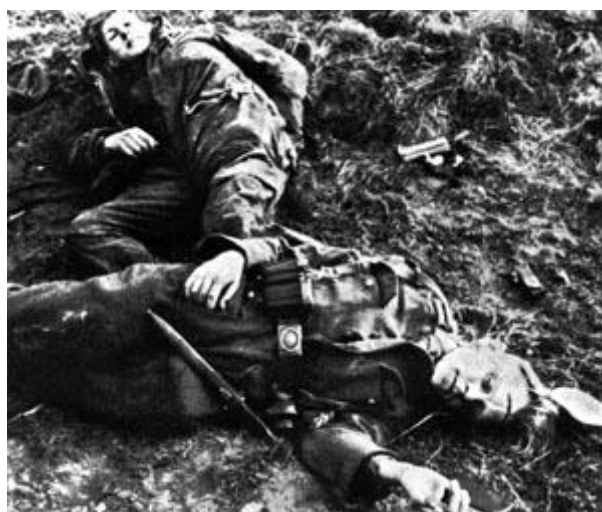
Young German defenders lie dead in the Hürtgen Forest. German casualty figures are hard to come by, but at least 28,000 Germans were killed, wounded, captured, or went missing.