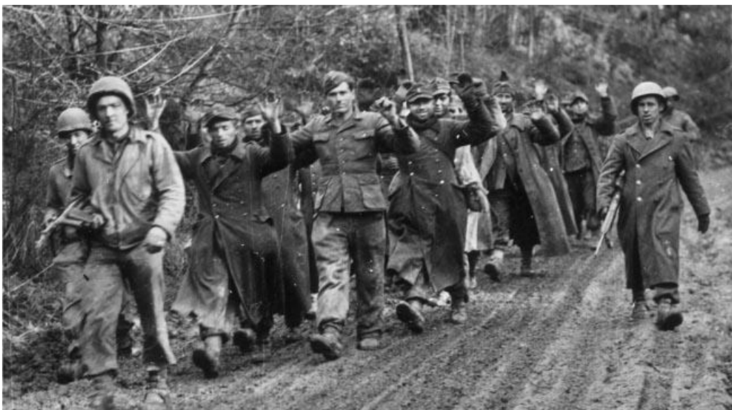
American soldiers escort a group of Germans captured during the battle to a POW cage somewhere behind the lines.