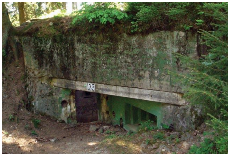
The entrance to a stout German bunker, part of the Siegfried Line, little changed since the fighting in late 1944.