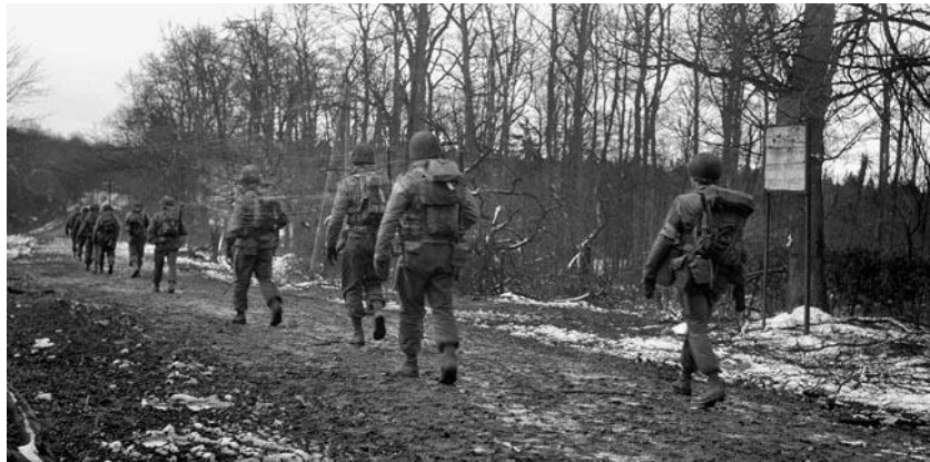
Soldiers of the 2nd Ranger Battalion slog their way along a muddy road on their way to Hill 400, the scene of a fierce stand against repeated German attacks.

He appealed to V Corps for assistance, specifically for the 2nd Ranger Battalion, which was nearby but under V Corps control.