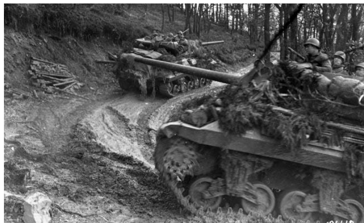
American M-10 tank destroyers crawl up a muddy road through the forest. The narrow, twisting roads and thick stands of trees made the use of armor all but impossible.

Although one company of the 121st Infantry had reached the edge of the forest, the Germans still held several hundred yards of the woodline east of the highway. This was a logical hiding place for antitank guns. These would be deadly for the tankers. Further, since the Germans still covered the road, American combat engineers could not sweep it for mines, including antitank mines. Finally, there was a large bomb crater near the southern edge of the woods that would have to be bridged before the tanks could begin to roll down the highway.