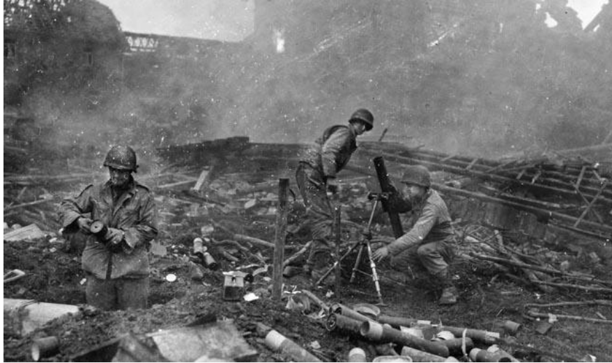
An 81mm mortar crew from the 22nd Infantry Regiment, 4th Infantry Division fires from the rubble of a village in support of rifle companies holding off a German counterattack at Grosshau, December 1, 1944.