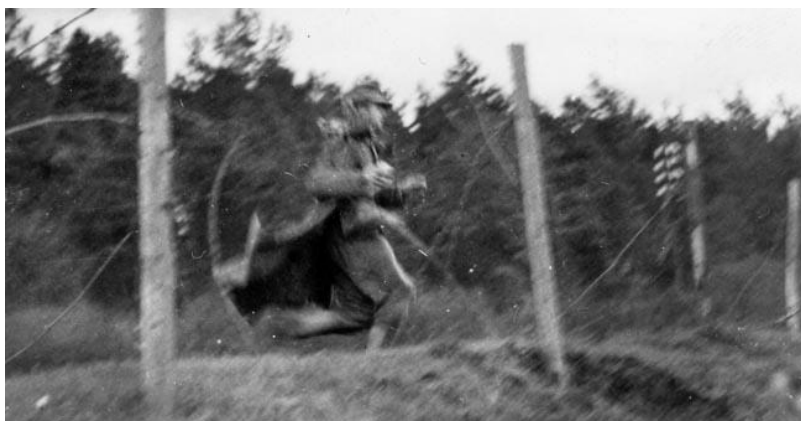
During early fighting in the Hürtgen Forest in November 1944, a German soldier quickly surrenders to troops of the U.S. 9th Infantry Division.