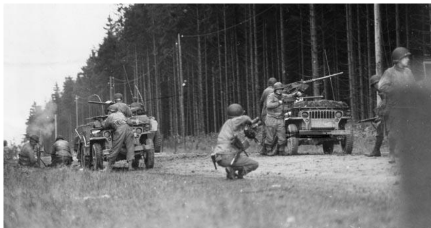
Taking up defensive positions in a clearing in the Hürtgen Forest, soldiers of the 28th Infantry Division prepare to engage the Germans. At left, a two-man team has just fired a round from a mortar.