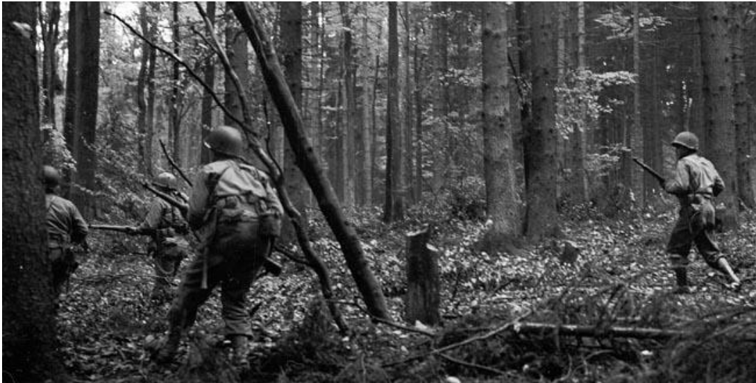
Soldiers of the U.S. 28th Infantry Division, nicknamed the “Bucket of Blood” because of their red keystone shoulder patch that identified them originally as a Pennsylvania National Guard division, advance warily through the dense Hürtgen Forest near the town of Voosenack.